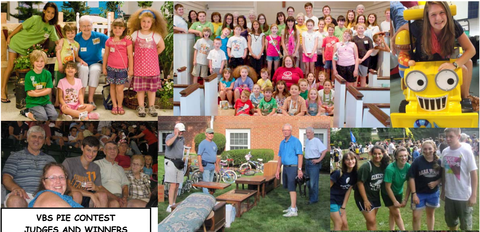
VBS PIE CONTEST JUDGES AND WINNERS