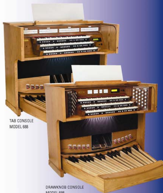
TAB CONSOLE MODEL 688