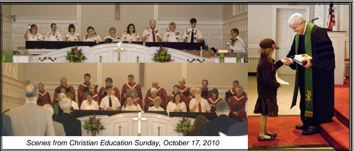
Scenes from Christian Education Sunday, October 17, 2010