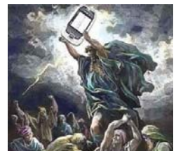
11. Thou shalt silence thy phones

Speaking of conversation and refreshments ... In order to enhance the reverence of our worship and to be considerate of our fellow congregants, we would like to kindly request all cell phone ringers be turned off AND that no refreshments be brought into the sanctuary (excepting, of course, those with a medical need of such). Please enjoy your coffee and snacks in Fellowship Hall, and please check that all phones, pagers and mobile devices are silenced before entering the sanctuary. Thank you for your kind consideration.