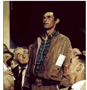
"TOWN HALL" MEETING JUNE 22, 10:30 AM