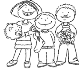
Heifer Coin Drive