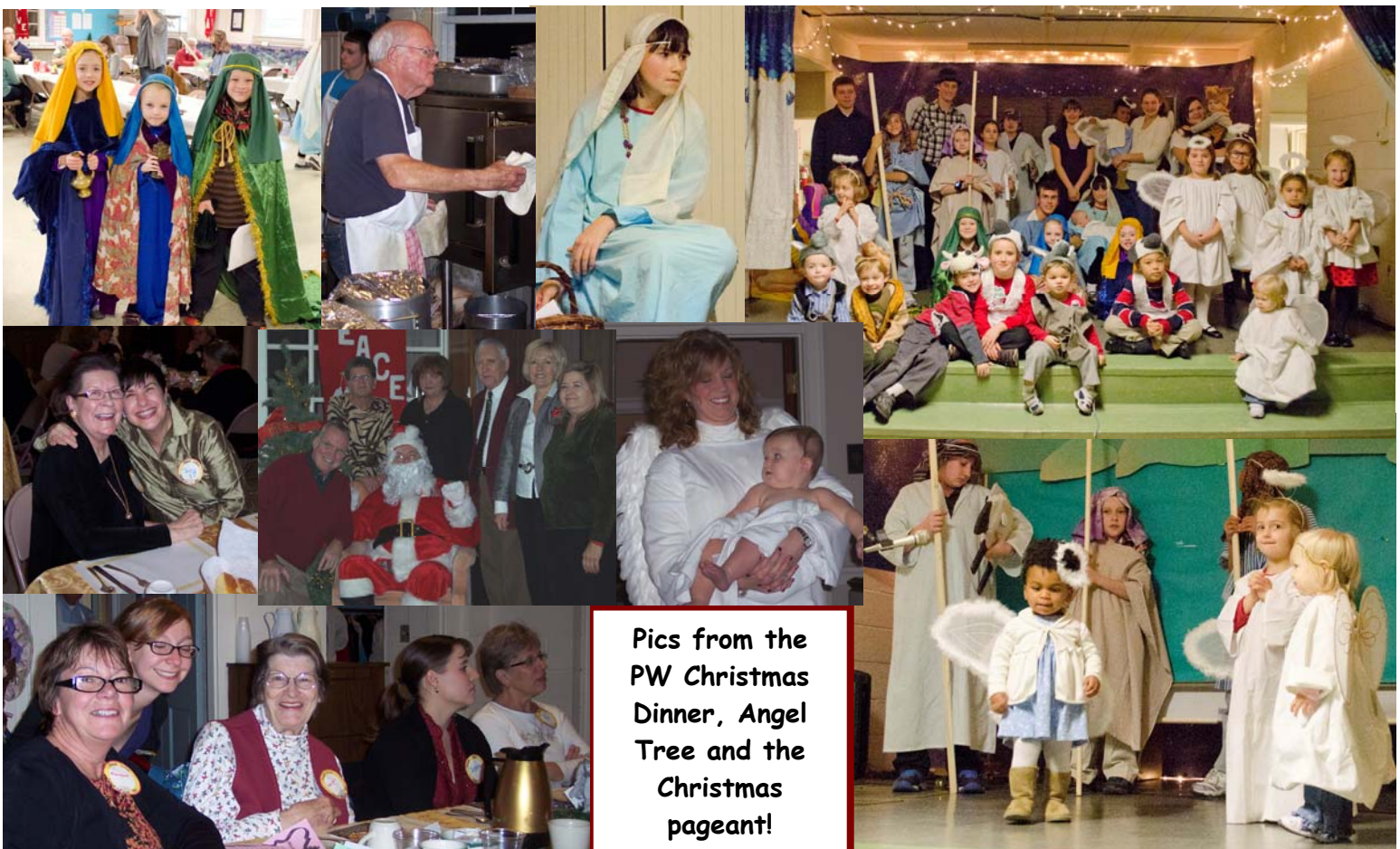
Pics from the PW Christmas Dinner, Angel Tree and the Christmas pageant!